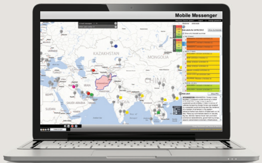
Amadeus Mobile Messenger map interface with risk intelligence

Traveller data within Amadeus Mobile Messenger is automated and updated in real-time, ensuring users always have the latest information to work with, which is critical for incident management. Various options to filter