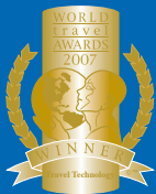
World's Leading Internet Booking Engine Technology Provider

Find out what we can do for you today - www.amadeus.com/vision