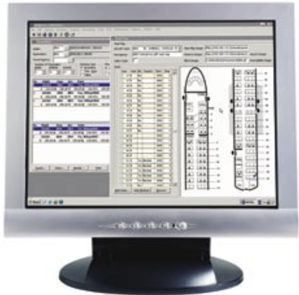
Results CMS by Amadeus: advanced seat reservation module.

Using a combination of the Amadeus existing core IP backbone network (including airline community networks), Amadeus private end point networks and the Internet, you benefit from a comprehensive and very cost effective solution for all your messaging and communications needs.