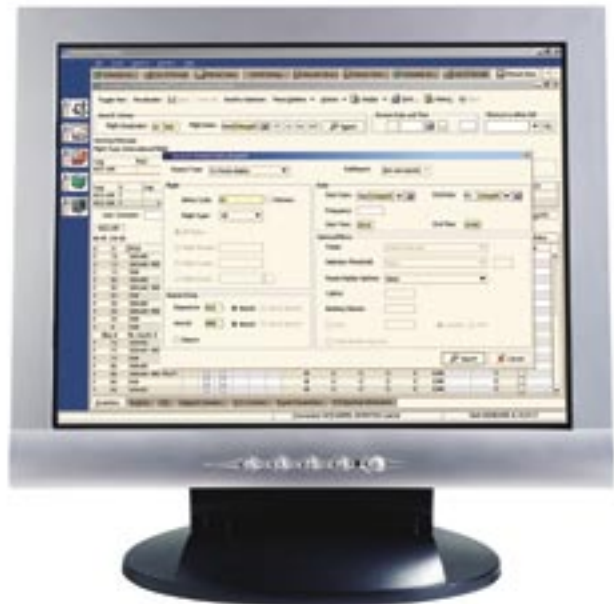
Amadeus Pioneer CMS: easy direct access from the inventory screen to real time reports.

Amadeus is supporting an adaptive and refreshed airline industry, in which the low cost model plays a leading role. We have built new Customer Management Solutions (CMS) comprising inventory, reservations and departure control, using Unix and Linux technology with relational databases as operating platforms. Our solutions meet all the requirements of Low Cost Carriers in terms of functionality, cost efficiency and flexibility going forward.