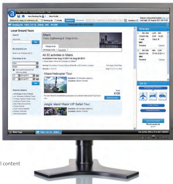
Integrated Partners: your local content

Book non-GDS content using the same workflow as your GDS content and integrate it fully into the booking file and back office.