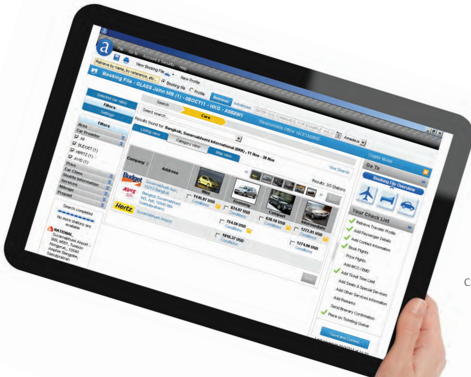
Cars: vehicle categories

Looking for more productivity helpers? Reminders, to-dos and full profile history are also in your back pocket with Amadeus Selling Platform Connect.