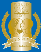
World's Leading Travel Technology Provider