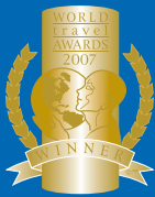
World's Leading Travel Technology Provider