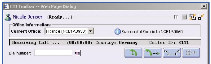
Dynamic Desktop: the Office ID switches depending on the caller's country or company