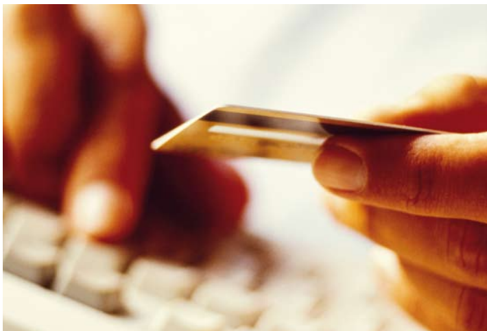
Reach new customers & increase your sales.

Having a highly efficient train service from airport to city centre is one thing - having an effective distribution reach is another. Today, many international travellers still don't know how they will get to their final city destination until they arrive at the airport. This situation can now change thanks to Amadeus Airport Express. Amadeus Airport Express provides an 'up-front', multi-channel solution putting your express rail service right alongside airlines - on the same screen. That means increased visibility and that will mean increased sales and revenues.