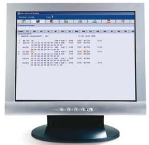
Neutral Availability Display showing all available offers

A full Low Cost Carrier booking process integrates seamlessly with your existing workflow. Flights are included in the familiar Amadeus principal displays. A secondary display shows the last seat availability and associated fares. Mid and Back Office reporting and accounting processes are also fully integrated and use the standard Amadeus Interface Record.