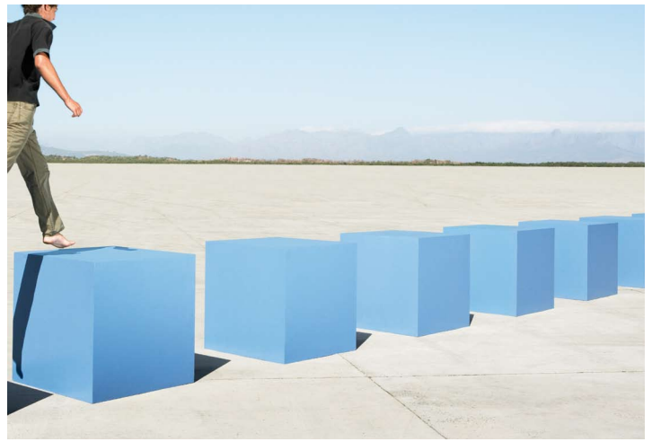
Step into the future and grow your business

You no longer have to spend endless time waiting for answers on the telephone. Amadeus Tours Suite comes with a clear GUI which after initial training becomes easy to use.