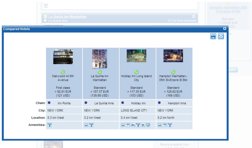
Figure 2: Hotel Compare dialog