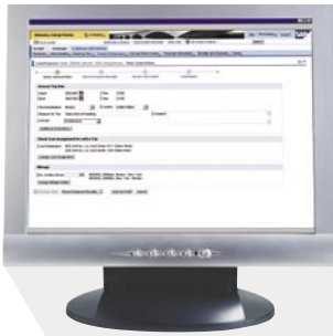
Expense management integration - pre-populated post-trip expense report