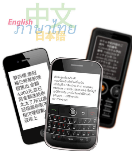
Multi-language screen and content

The user interface and message contents of Amadeus SMS Solution are localised to cater to your needs. Feel more comfortable to work in the language you want. Be it English, Traditional Chinese, Japanese or Thai !