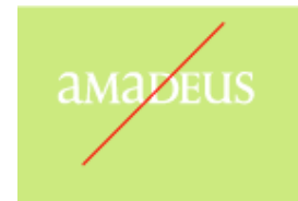
figure 14: reversing the logo out of a colour or tint that does not contrast sufficiently