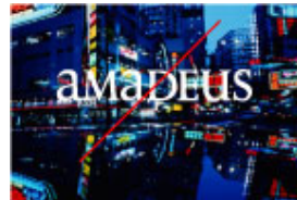
figure 13: reversing the logo out of an image with lots of detail or poorly contrasting tone