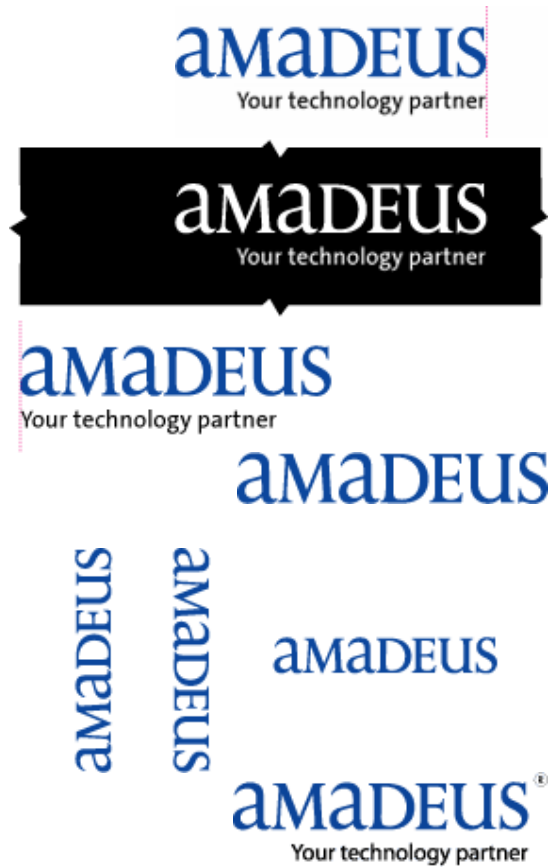
figure 6: Registered Trademark. Use only if legally required.

figure 5: vertical and horizontal alignment