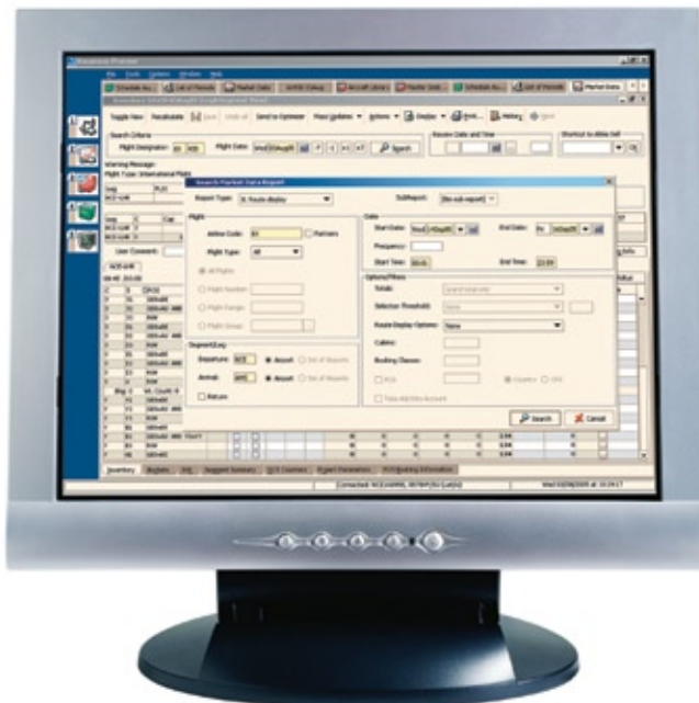
Amadeus Pioneer CMS: easy direct access from the inventory screen to real time reports.

Our global support structure spans over 215 markets, with 6,000 employees worldwide. Close to 1,000 are specialist airline technology developers, based in Nice, London and Sydney. Our data centre in Germany manages more than 230 million transactions a day and processes up to 2 million net bookings per day.